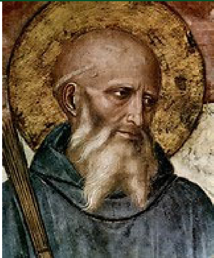
Saint Benedict July 11th